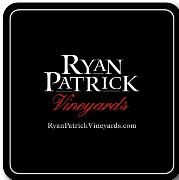
Image of coaster is not actual size.

Please use the enclosed Order Form to submit your order or call 877.423.2627.